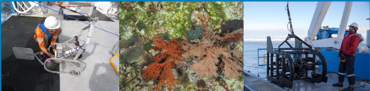
Left: Australian Institute of Marine Science; Centre: Geoscience Australia; Right: Marine National Facility.