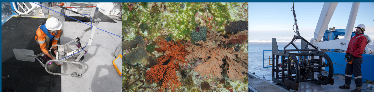
Left: Australian Institute of Marine Science; Centre: Geoscience Australia; Right: Marine National Facility.